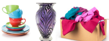
Textiles, housewares, windows, ceramics, and other reusable items.