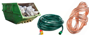
Scrap metal, wires and cables, home and construction waste.